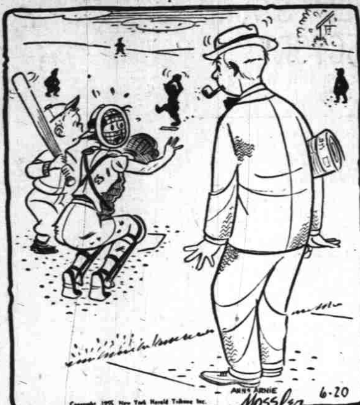
"It's the biggest game of the season, and their catcher came down with chicken pox!"