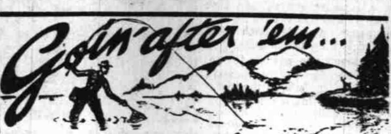
Looks as if the king salmon have hit Westport, Wn., with an all-out assault. More than a dozen kings were taken last week weighing between 30 and 35 lbs. The average king was running at 20 lbs. Nice thing about was that nearly every angler who mooched with herring took a limit of fish.

Statesman, Salem, Ore., Monday, June 13, 1955—(Sec. 2)—1