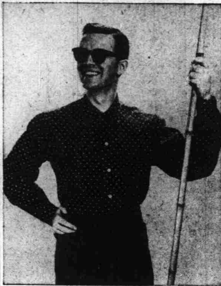
Cool as a summer breeze . . . is this smart new sport shirt in tissue thin British wool challis. In maroon with white polka dots, this shirt is one of a large collection for summer sportswear and a favorite with the men.