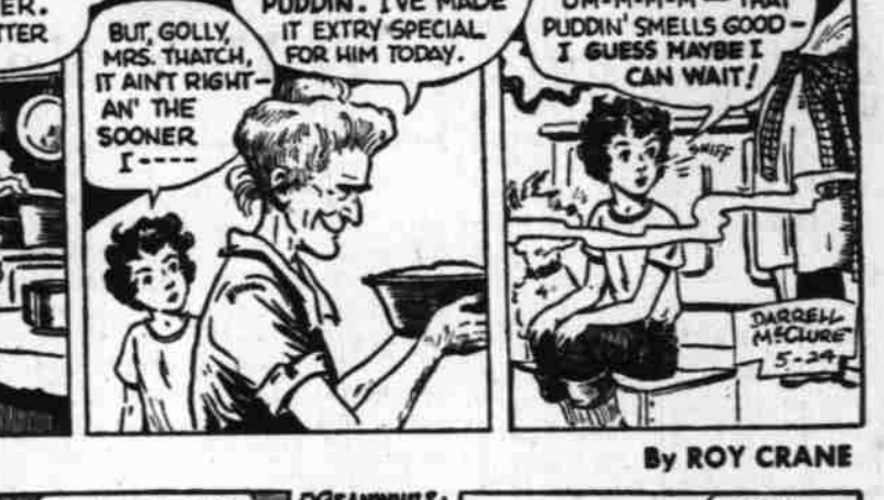
BUT I GUSHTA GO SEE HIM NOW, AN'— UM-M-M-M— THAT PUDDIN' SMELLS GOOD— I GUESS MAYBE I CAN WAIT.