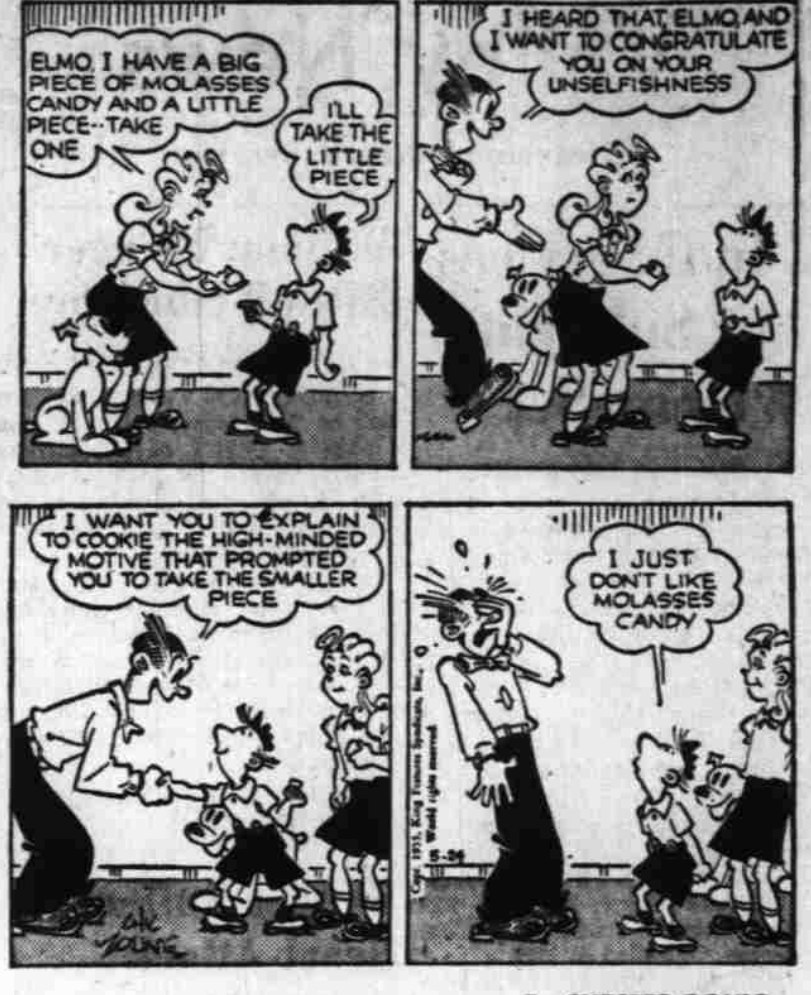
I HEARD THAT ELMO AND I WANT TO CONGRATULATE YOU ON YOUR UNSELFISHNESS.