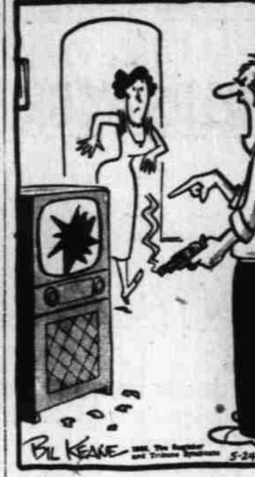
"The mystery play was so dull I thought another murder would help!"