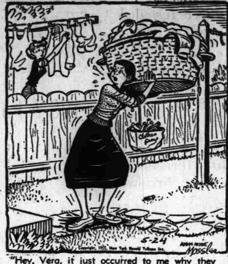
"Hey, Vera, it just occurred to me why they say, 'never underestimate the power of a woman!'"