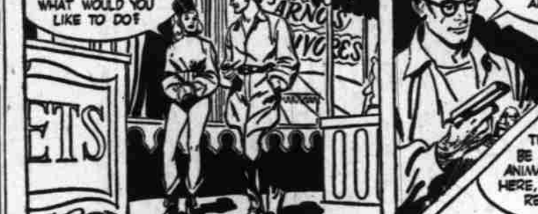
I KNOW IN ANIMAL ACTS BLANK CARTRIDGES ARE USED...