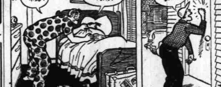
Wait 4-50! Too much! $3.75! Wake up, folks. Time to go in! Quiet! You'll disturb the roosters. Gosh, the middle of the night! What about breakfast? As soon as we hit a joint, it's open.