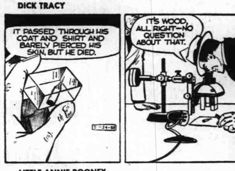
IT PASSED THROUGH HIS COAT AND SHIRT AND BARELY PERCED HIS SKIN, BUT HE DIED.