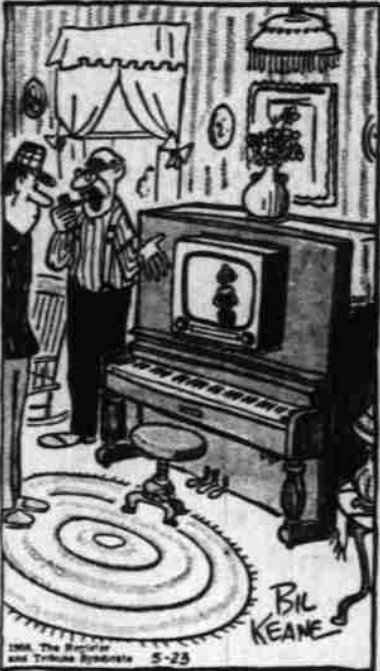
"The old piano rolls were wearing out anyway."