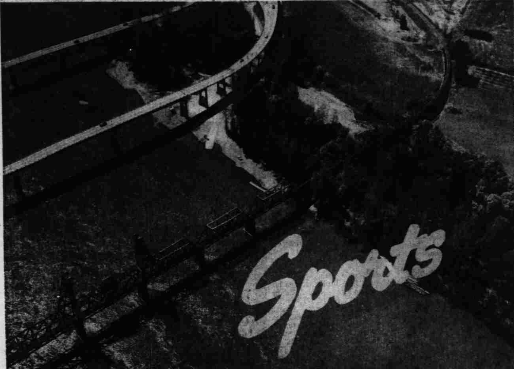
Scene of Sunday's Willamette River Racing Regatta

The fast-growing and popular Wallace Marine Park, in the shadows | Motor Boat Racing Association. Boats and drivers, including world of the three bridges which connect Salem and West Salem, is champions, will participate, many being from California and Wash-pictured in this aerial photo, and will be the scene of a racing ington points. Salem Boat Club "Booster Ribbons" will serve as percentage points ahead of the regatta Sunday, starting at 1 p.m. The program is to be a benefit admission tickets. (See story next page.) sponsored by the Marine Park Improvement Club and the Oregon