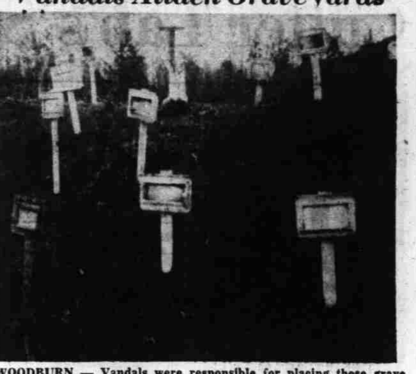
WOODBURN—Vandals were responsible for placing these grave markers in a sand pile at the Engineer's Sand and Gravel Co. on the Wheatland Ferry road. The markers were found by Deputy Sheriff Roy Lamb, who took the picture.