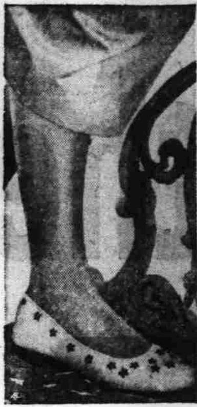
LAUREL LEI . . . Trim new poplin pump with contrast print, dressy enough for town wear, in four colors.