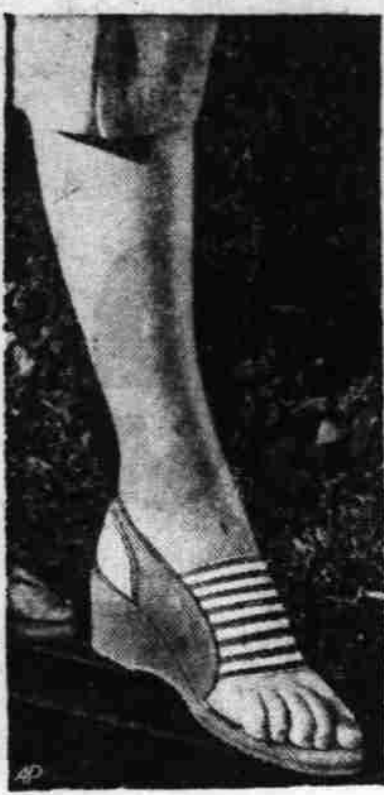
BASQUE . . . Open wedge shoe for indoor or outdoor wear, with wide striped laces instep gore, in red.