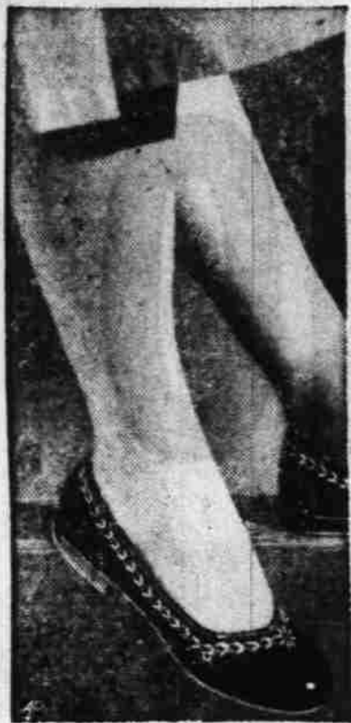
LINEN BOUQUET . . . Smart flat in Belgian linen with flower embroidery, hard sole for dancing dates.