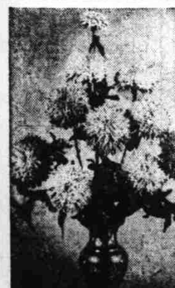
Zinnias provide a delightful mixture of the lighter colors.

In this process many plants thinned out can be used for the table. Lettuce, especially, is usable as soon as the leaves are two inches across. Some gardeners never thin lettuce, but let it grow in crowded rows, pulling as needed or even cutting off the leaves, so that more will grow. This never gives lettuce of the best quality, and it causes the plants to bolt to seed earlier than normally.