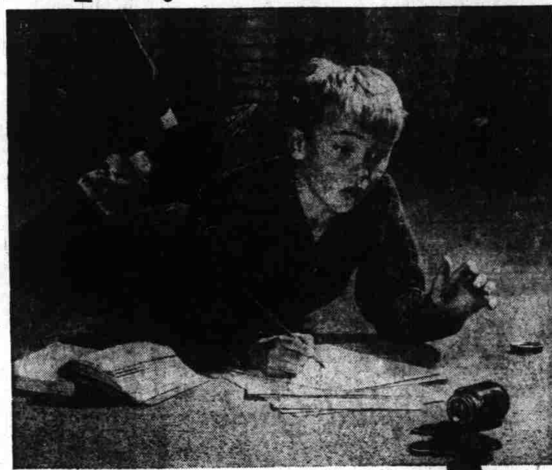
Not even INK can mar its Beauty!

The BRAND NEW carpet that shrugs off stains!