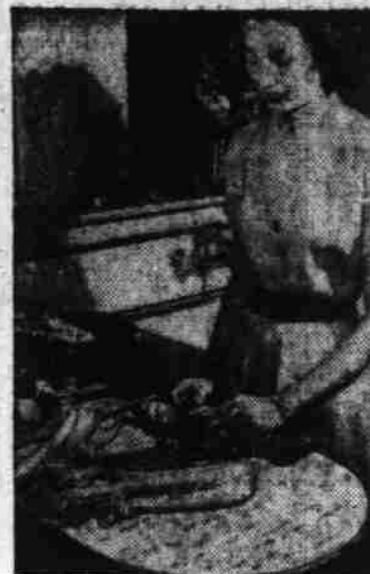
Dress up work surfaces in your kitchen and laundry with resilient, vinyl-by-the-yard. It can be installed on any level, clean, counter surface.

A situation on the north side of the house is not likely to be favorable for the garden illustrated, unless it is placed beyond the line to which the shadow of the roof extends in midsummer at 10 a. m. The location should be free of shade from trees and buildings for at least six hours a day.