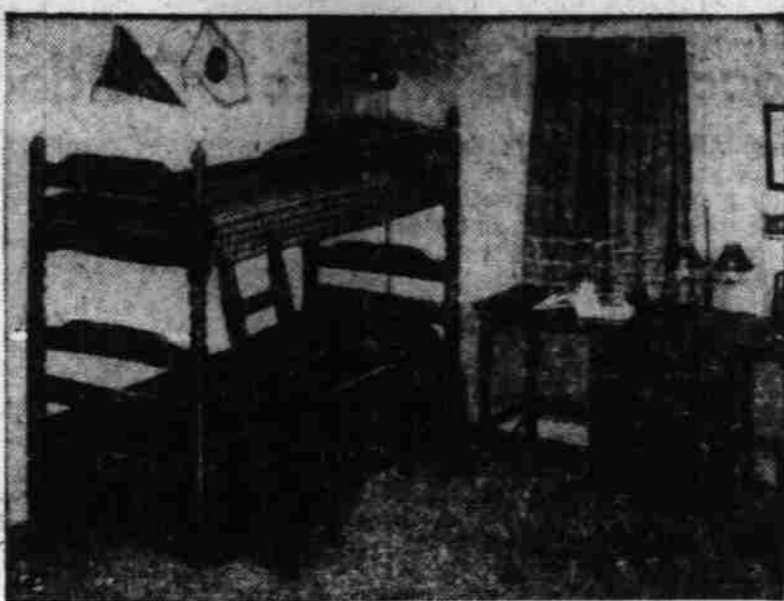
For a couple of cowboys—These bunk beds may be stacked or used as twin beds.

Seam the lengths together, hemming the two ends. Put the spreads on the bed to locate where the white cotton fringe is to go. Pin the fringe in place so that it outlines the edge of the mattress. Mark locations for corner slits in the foot of the spread. Remove and check