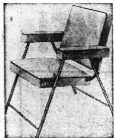
This new, upholstered folding chair keynotes real lounge comfort, beauty and the convenience of easy storage. Upholstered in vinyl plastic.

Check with your building supply dealer for plans for your attic remodeling job.