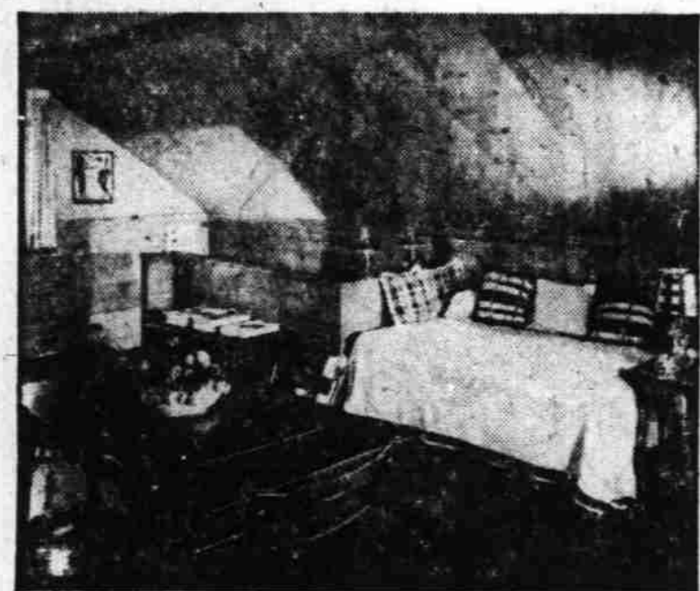
Pre-decorated, wood-grained gypsum wallboard—shown here in a knotty pine finish—gives smartness to this remodeled attic room. Economical and easy to install, this type of wall covering is increasingly popular.

Protect auto seats with hardboard when moving heavy or sharp objects, or when children's feet are muddy.