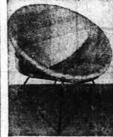
This deep-seated basket chair is soft and comfortable. . . . best of all, at home indoors or out.

Do-it-yourself, but first get expert advice.