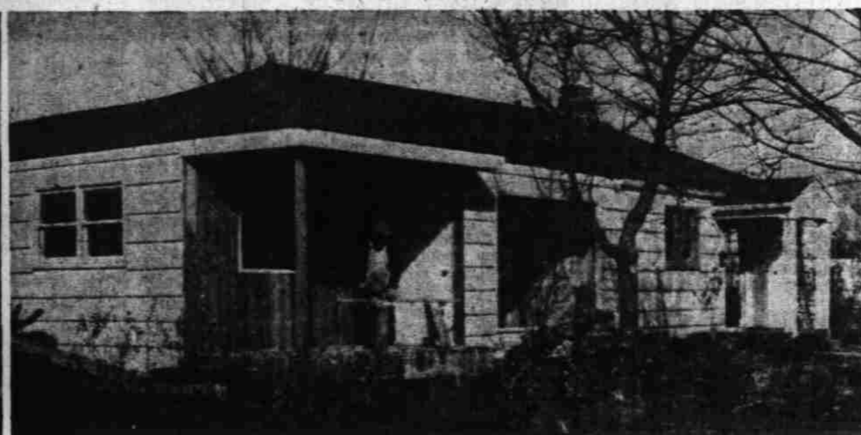
This is the newly finished home of F. E. Pulse at 1075 Electric Ave. which was remodeled from a small one-bedroom house (shown above) already on the property. The remodeling job included addition of two bedrooms and expansion of the living room.