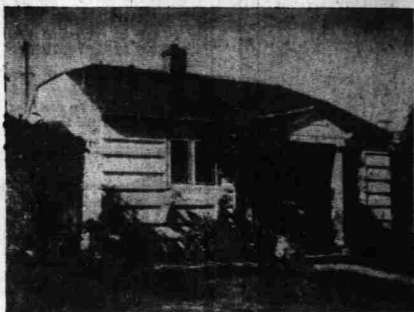
This tiny one-bedroom house at 1075 Electric Ave. soon became too small for its owners. However, the location was what they wanted, so, instead of selling it and buying a larger home, they had it remodeled into the three bedroom home shown below.