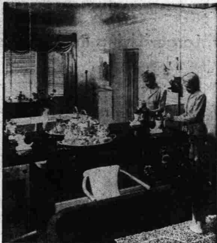
A smart trick to make a small dining room look larger: panels of floor-to-ceiling mirrors. Also, handsome mirrors reflect the many scenic views in the Salem area.

Just a word of caution . . . never place mirrors so they reflect a drab wall, a closed door, or an uninteresting view if you want to enjoy the 'magic of a mirror in your home.'