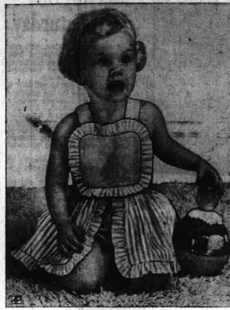
TODDLER SUN STYLE . . . The last word in sun outfits for the littlest set is this split-skirt chambray sunsuit with romper pants, designed by thomas.