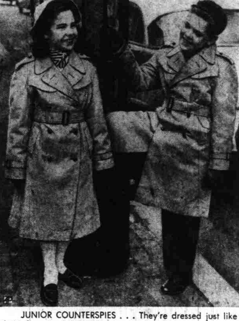
their favorite TV sleuths in regulation imported trench coats, water-and-wind-repellent and washable.