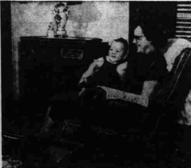
Music hath charms and it certainly works wonders in helping to put an active little boy to sleep. The cost to operate an electric radio-phonograph? . . . a penny for 10 hours.