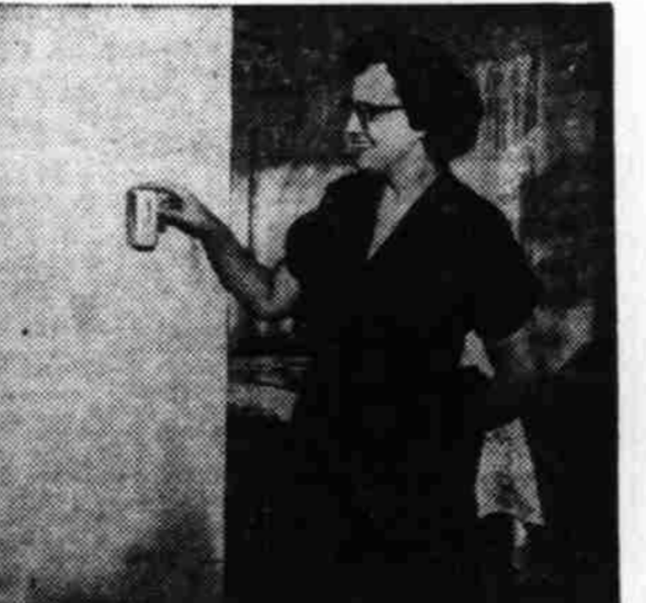
Regardless of what fuel you burn it is electricity that operates your thermostat to keep your home at a comfortable, healthful level. About a nickel a year is all it costs!