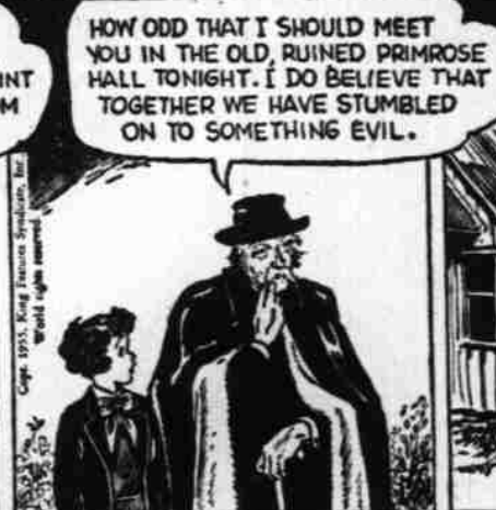
I AM NOT A DETECTIVE, BUT MY MANY YEARS SPENT UPON THE BENCH TAUGHT ME THEIR METHODS . . AH , WILL I BE SEEING YOU IN THE OLD ZERO AN ME HALL AGAIN? MEET EACH OTHER THERE EVERY NIGHT AFTER IT STARTS By ROY CRANE