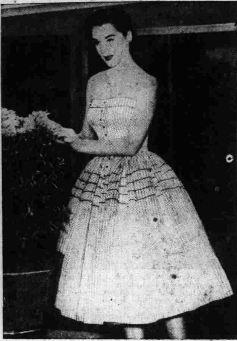
PETTICOAT FEVER ... Young girls like full-skirted party dresses, such as these above. At left is a blue-and-white Austrian print cotton sun-or-date dress with white rickrack trim on its crisp skirt. At right, a white Swiss organdie dance dress with pink and black stripes and heart-shaped black jet buttons.