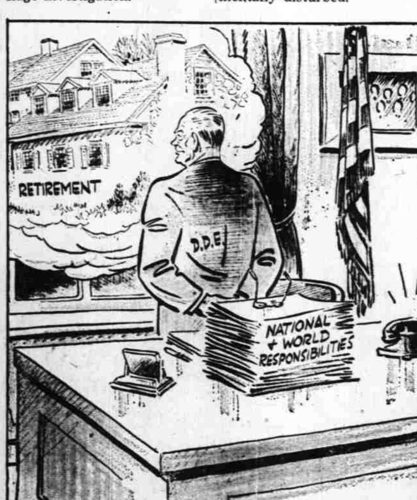
SECOND BATTLE OF GETTYSBURG

Amoy Bay, a short distance Sir William refused any of fom the Nationalist-held island ficial comment, but Moscow diplomatic observers were in-Sent Home: All members of clined to attach no political sighe Czechoslovak and Romanian nificance to the incident. They egations in Sweden, after 11 dismissed it as the individual uspects were jailed in an espi-action of a person presumably mentally disturbed.