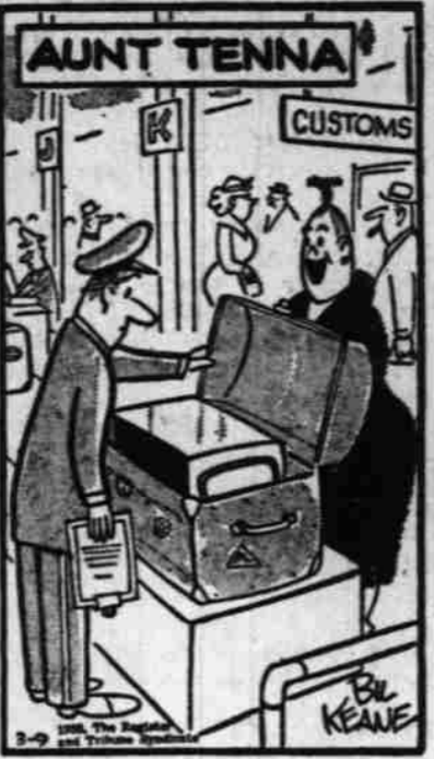
"I'm carrying only what I need."