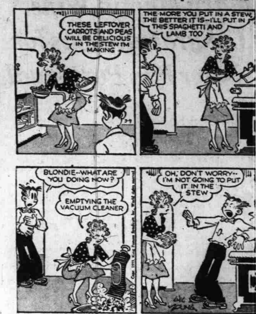
By CHIC YOUNG