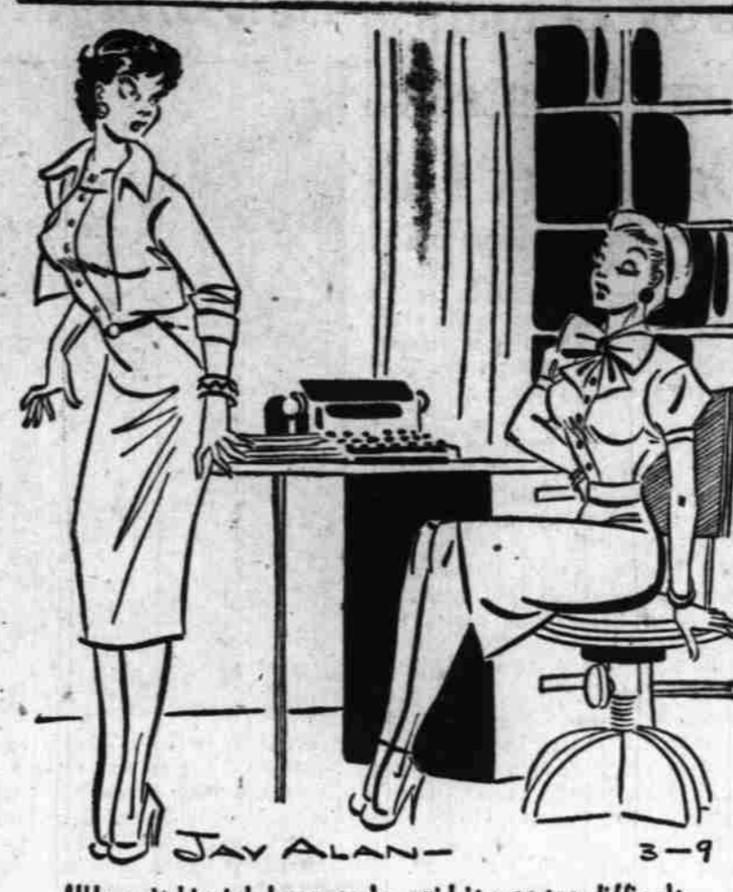
"He quit his job because he said it was too difficult to make a success of marriage if we both worked!"