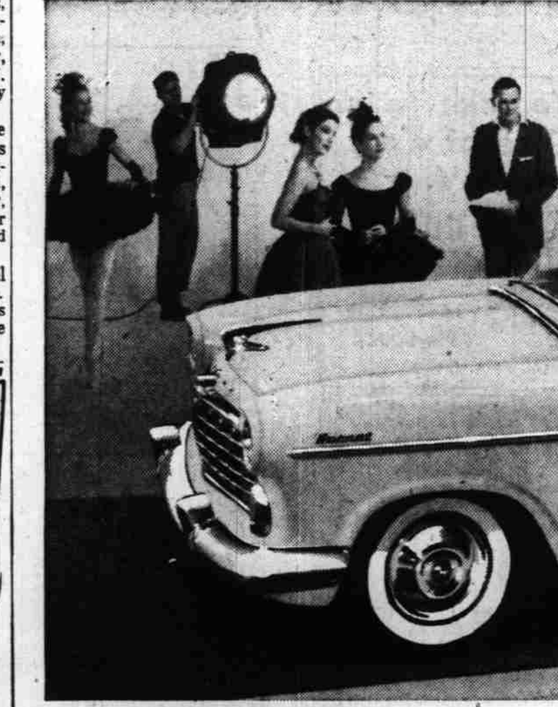
The most beautiful performers of them all... the brilliant, new Hudson Hornet and the bright, young stars of the New York City Ballet.

NEW HORNET V-8 ENGINE LATEST, GREATEST of the V-8's. Short-stroke pistons reduce friction, deliver quick power. Smooth, whisper-quiet, rugged! Or choose the Championship Six, with more than 150 stock-car victories. All new Hudsons feature Double Strength Single Unit Body, new Deep Coil Ride. Airliner Reclining Seats and Twin Travel Beds are standard on many, available for all other models. All-Season Air Conditioning available for all models at hundreds less than any other system. See these exciting new cars now! Hudson Hornets • Wasps • Ramblers • Metropolitans are products of American Motors SHROCK MOTOR COMPANY 267 N. Church St. Salem, Ore.