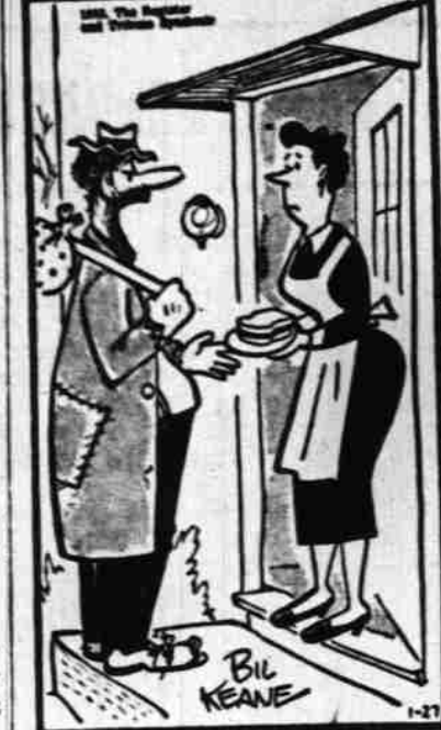
"Mind if I come in and watch television while I eat?