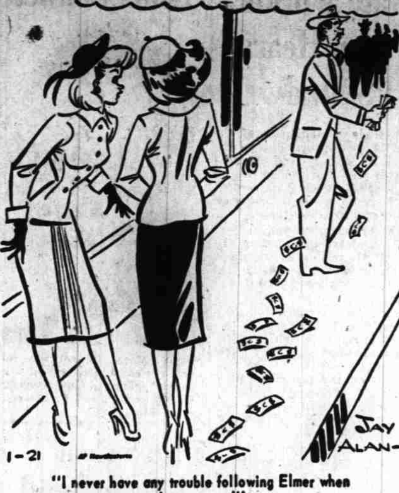
"I never have any trouble following Elmer when he goes out!"