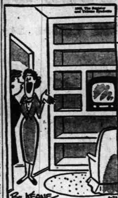
... And this is the library.