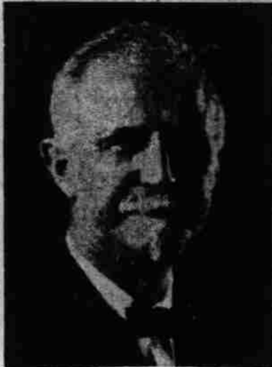
Roger W. Babson, noted financial and business reporter, becomes a regular contributor to The Oregon Statesman starting today.