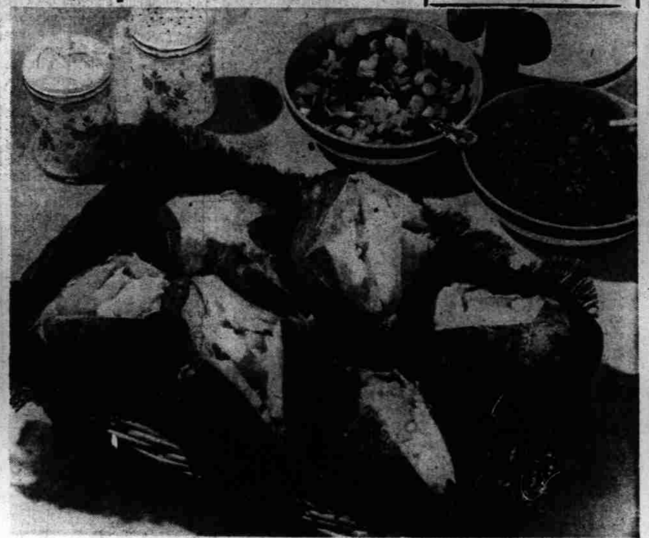
BAKED . . . with a little glamor