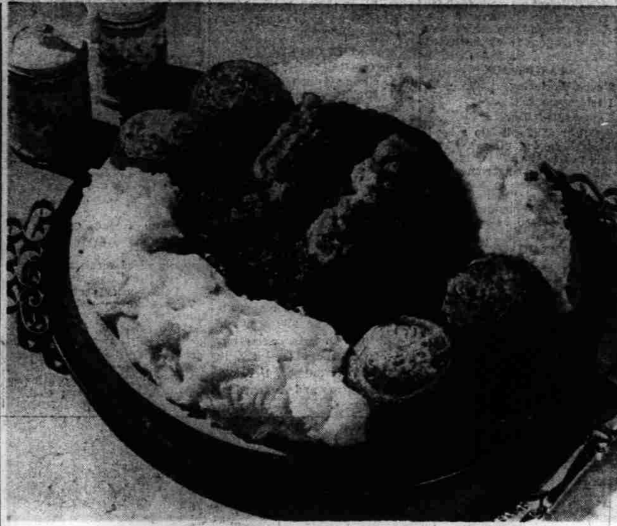
A la DUCHESS . . . with a swirl

Cut prunes from pits into pieces. Sift flour, sugar, chocolate, salt and soda together 3 times. Beat egg lightly and combine with sour milk, butter, vanilla and prunes. Stir in dry mixture and beat until smooth. Turn