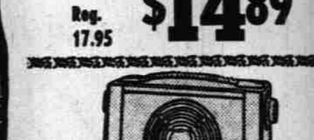
TABLE MODEL RADIO Reg. 17.95 $14.89

Firestone "Caravan" PORTABLE RADIO Plays AC-DC Reg. 35.95 or on Batteries $26.95 Lightweight BATTERIES EXTRA