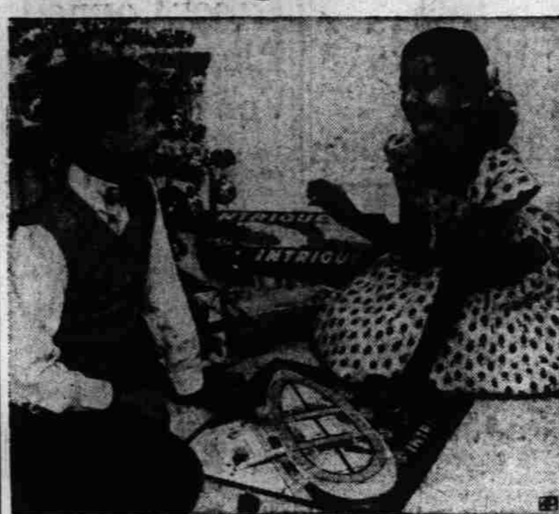
EVERYBODY CAN PLAY . . . The television stay-at-home influence has precipitated a new boom in parlor games in which the whole family participates. One of the newest is Intrigue, a whodunit technique played on a board version of an ocean liner.