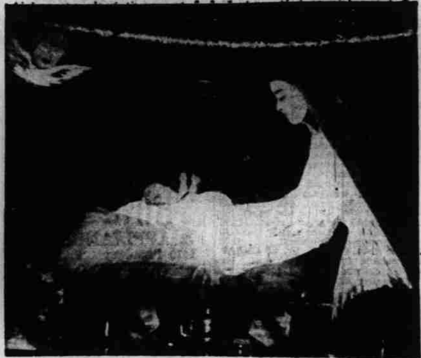
MT. ANGEL—This city's "dark streets shineth" with paintings of the Christ child and the manger scene this season as the result of a project by students of Mt. Angel Academy who have done the artwork on the city's store windows as part of their campaign to "Put Christ back into Christmas."