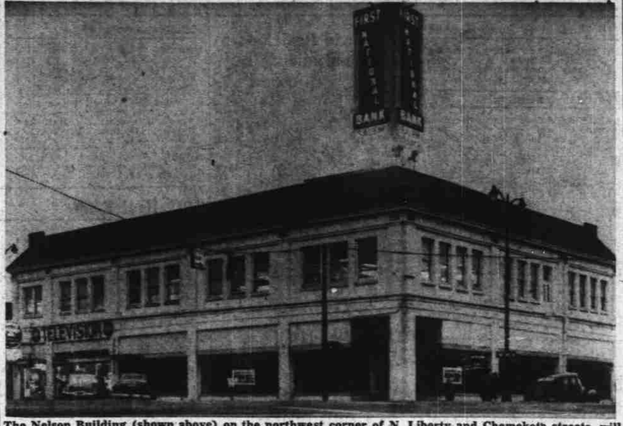
The Nelson Building (shown above) on the northwest corner of N. Liberty and Chemeketa streets, will house a new business in Salem, a Weisfield's Inc., jewelry store, it was learned Tuesday. The store is to be established in early January. (Story on page 1.)