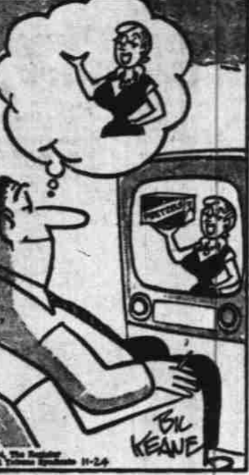
"Remember to look for this package at your grocer's..."