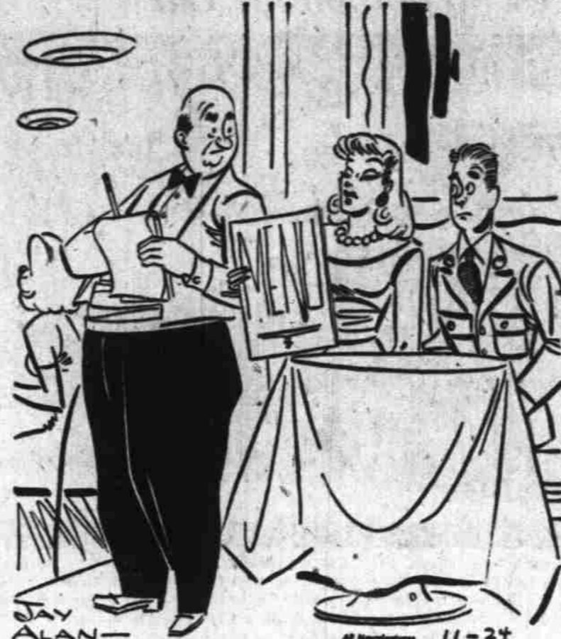
"You've no idea, Harry, how hungry I've been to see you."