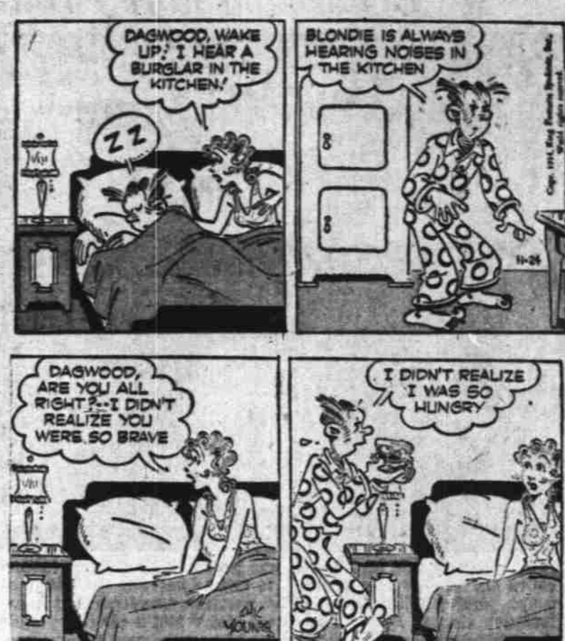
"DAGWOOD, WAKE UP! I HEAR A BURLAR IN THE KITCHEN!"