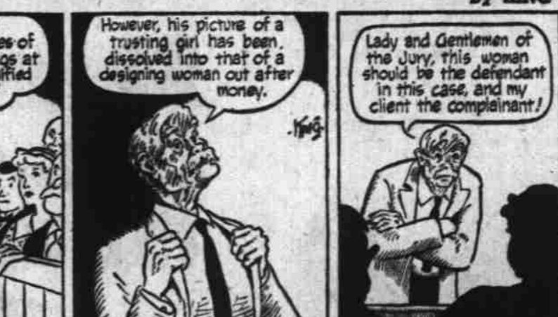
BY FRED LASSWELL