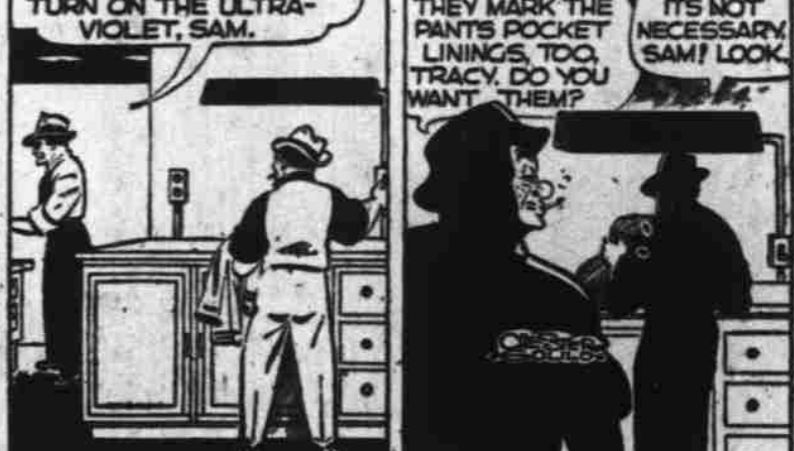
BY DARRELL MCCLURE