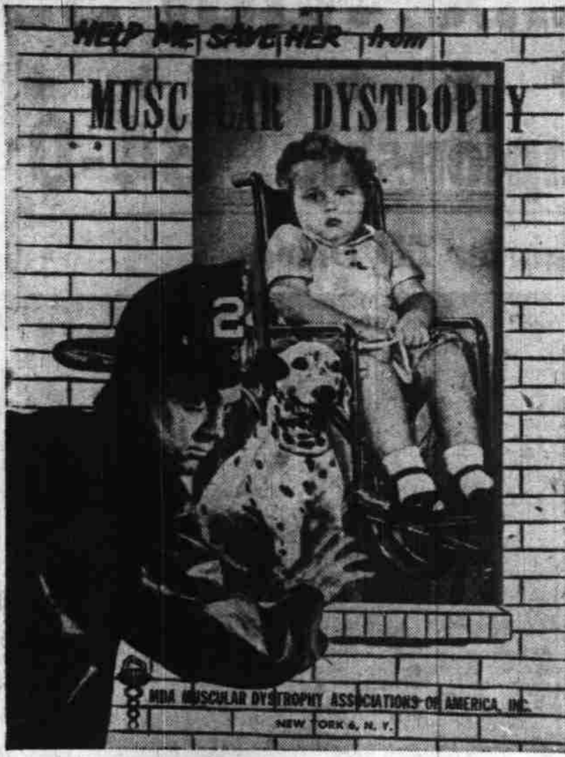
This is a copy of a poster, now appearing nationwide, urging contributions to the Fire Fighters March for Muscular Dystrophy during the Thanksgiving season. A house-to-house canvass seeking funds for research is to be undertaken.