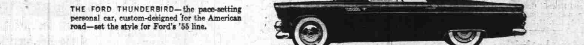
THE FORD THUNDERBIRD—the pace-setting personal car, custom-designed for the American road—set the style for Ford's '55 line.

"Satisfaction guaranteed or your money back" SEARS 550 N. Capitol