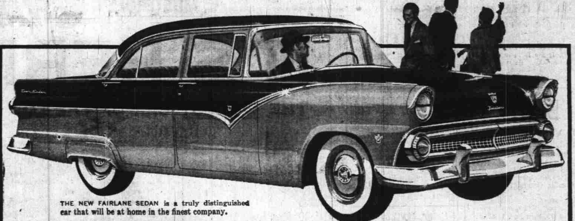
THE NEW FAIRLANE SEDAN is a truly distinguished car that will be at home in the finest company.

And Ford's long, low Thunderbird-inspired lines are complemented by exciting new interior styling—and many rich upholstery materials never before used in an automobile.