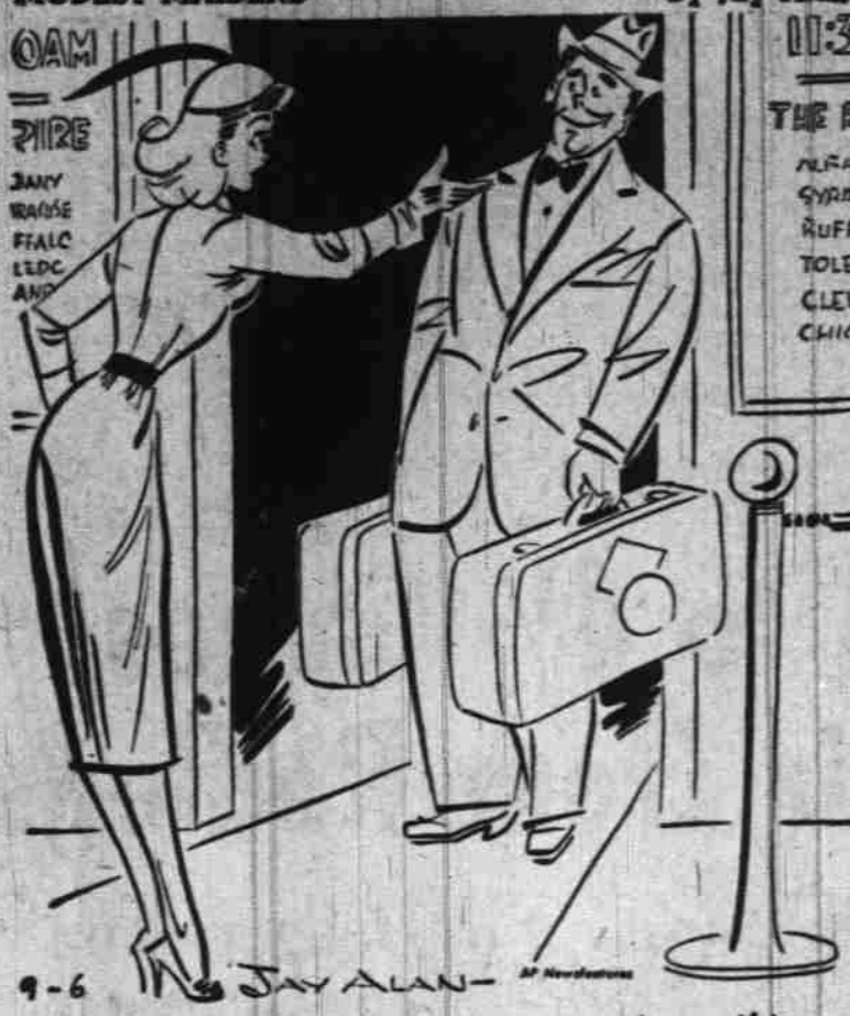
"I'd love to keep up correspondence with you, if it weren't for writing those letters!"