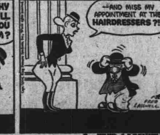
By FRED LASSWE

OAC 550 kc. 10:00 News & Weather; 0:15 Especially for Women; 10:45 hummer Story Time; 11:00 Concert iall; 12:00 News and Weather; 12:15 Icon Farm Hour; 1:00 Ride "Em Cowboy; 1:15 Oregon Panorama; 1:30 Icland Calling; 1:45 Golden Mo-