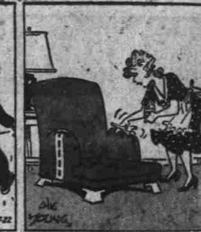
By CHIC YOUNG