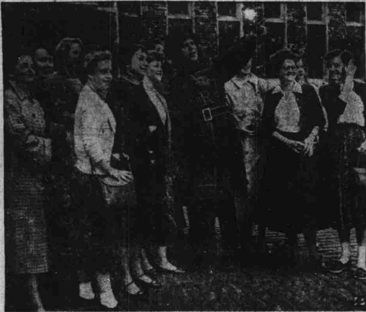
TOWER TOUR — A yeoman warder points out a feature of the Tower of London to members of the Smith College Chamber Singers during a stop on their European concert tour.