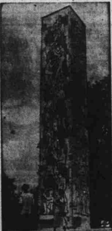
RESTORED RUIN — Mosaic depicting destruction and reconstruction in French sector of Berlin were created from rubble taken from bombed buildings.