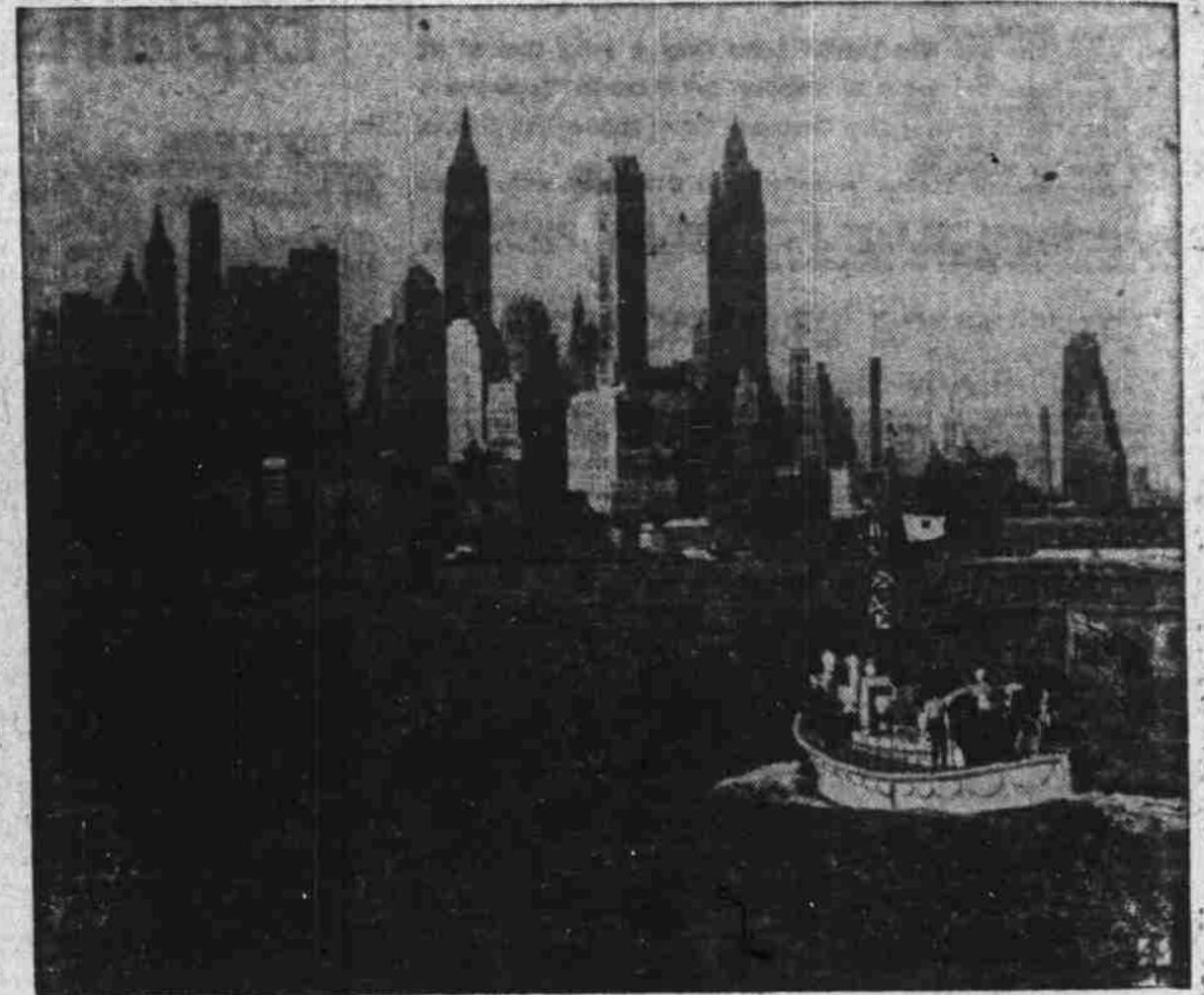
COMING INTO PORT — The motor yacht Aries, a converted 61-foot lifeboat, sails into New York harbor after a 33-day trans-Atlantic voyage from Hastings-on-Thames, England.