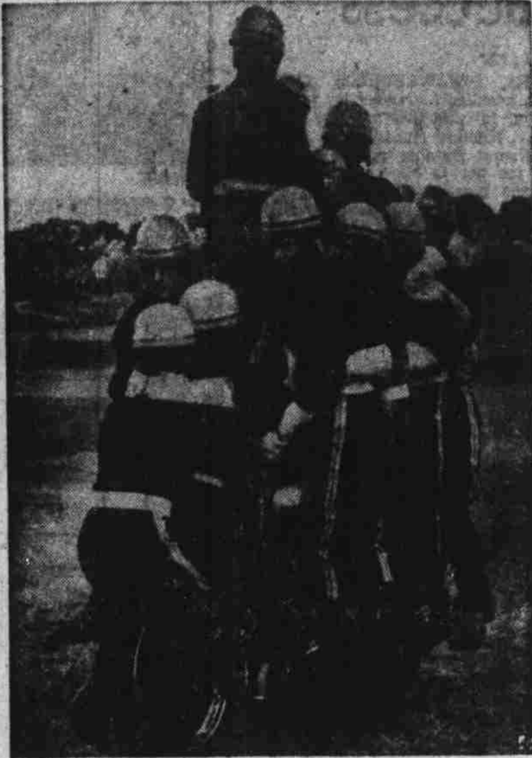
PITY THE DRIVER — For there are 15 men on this moving motorcycle as members of British Royal Armored Corps rehearse stunt at their Bovington quarters for a London display.