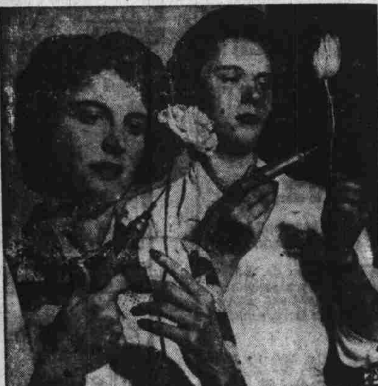
LIFE PRESERVERS — Two Dutch girls inject chemicals into cut flowers in Dusseldorf, Germany, flower shop. Process, a Dutch trade invention, keeps flowers fresh for months.