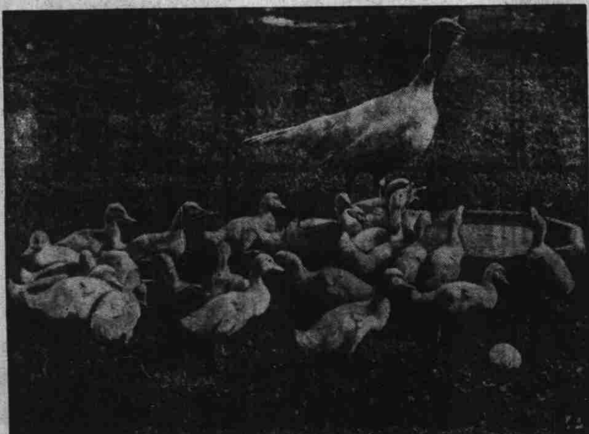
MATERNAL MIXUP — A turkey hen guards an adopted brood of 24 ducklings which it won by scaring off two chicken hens that hatched the ducklings on a Gahanna, Ohio, farm.