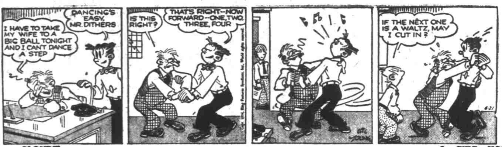
BLONDIE By CHIC YOUNG