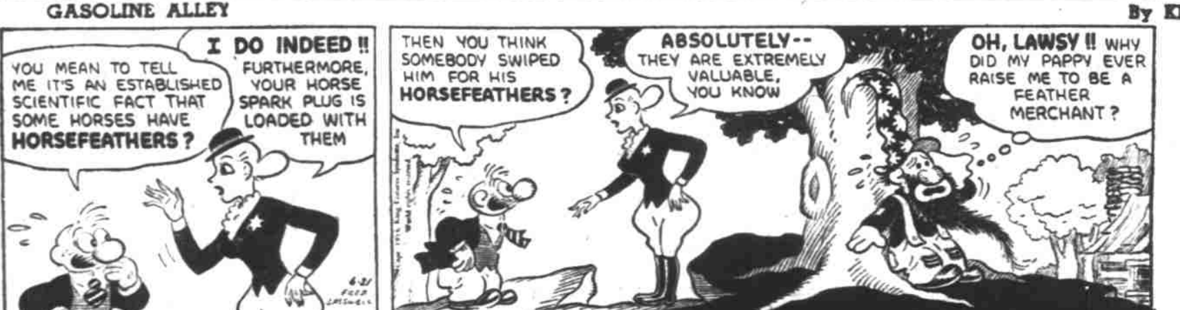
GASOLINE ALLEY By KING