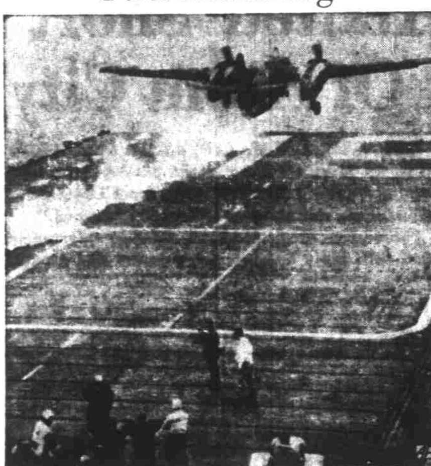
SAN DIEGO, Calif.—The Navy released photo showing the first launching of an airplane from a U. S. carrier by steam catapult instead of a hydraulic catapult. It shows two-engine S2F1 hunterkiller anti-submarine plane being shot into air from carrier Hancock at sea off San Diego, Calif.