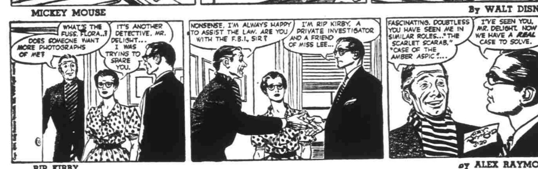
By ALEX RAYMOND