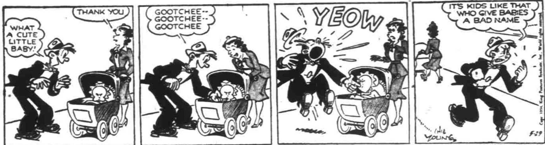
By CHIC YOUNG