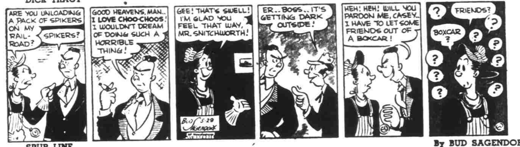
By BUD SAGENDORF