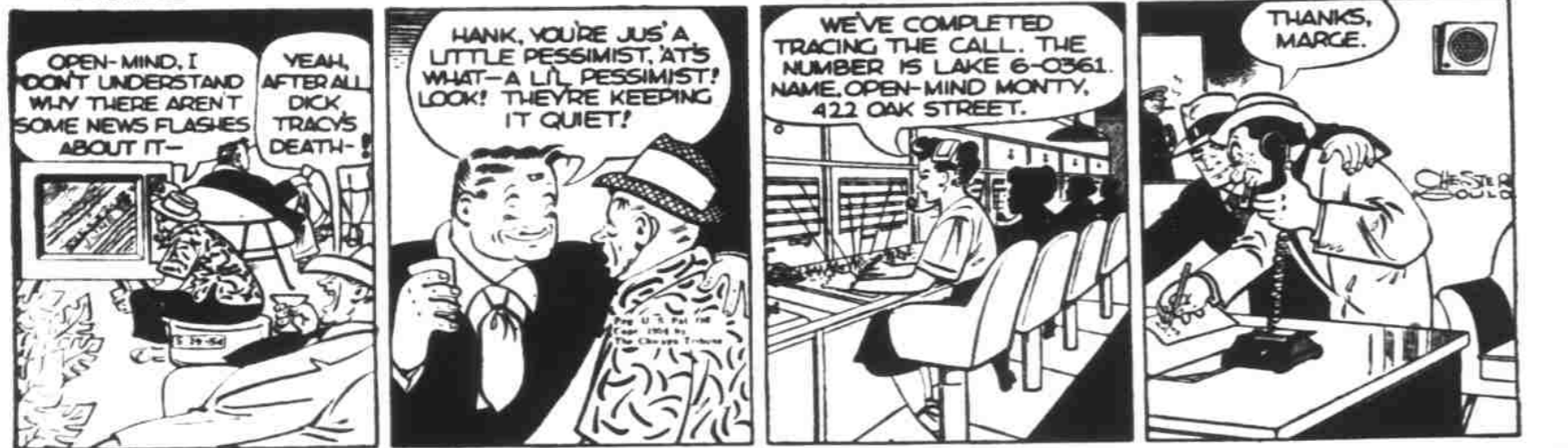
By CHESTER GOULD