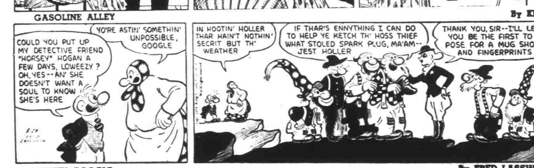
By FRED LASSWELL