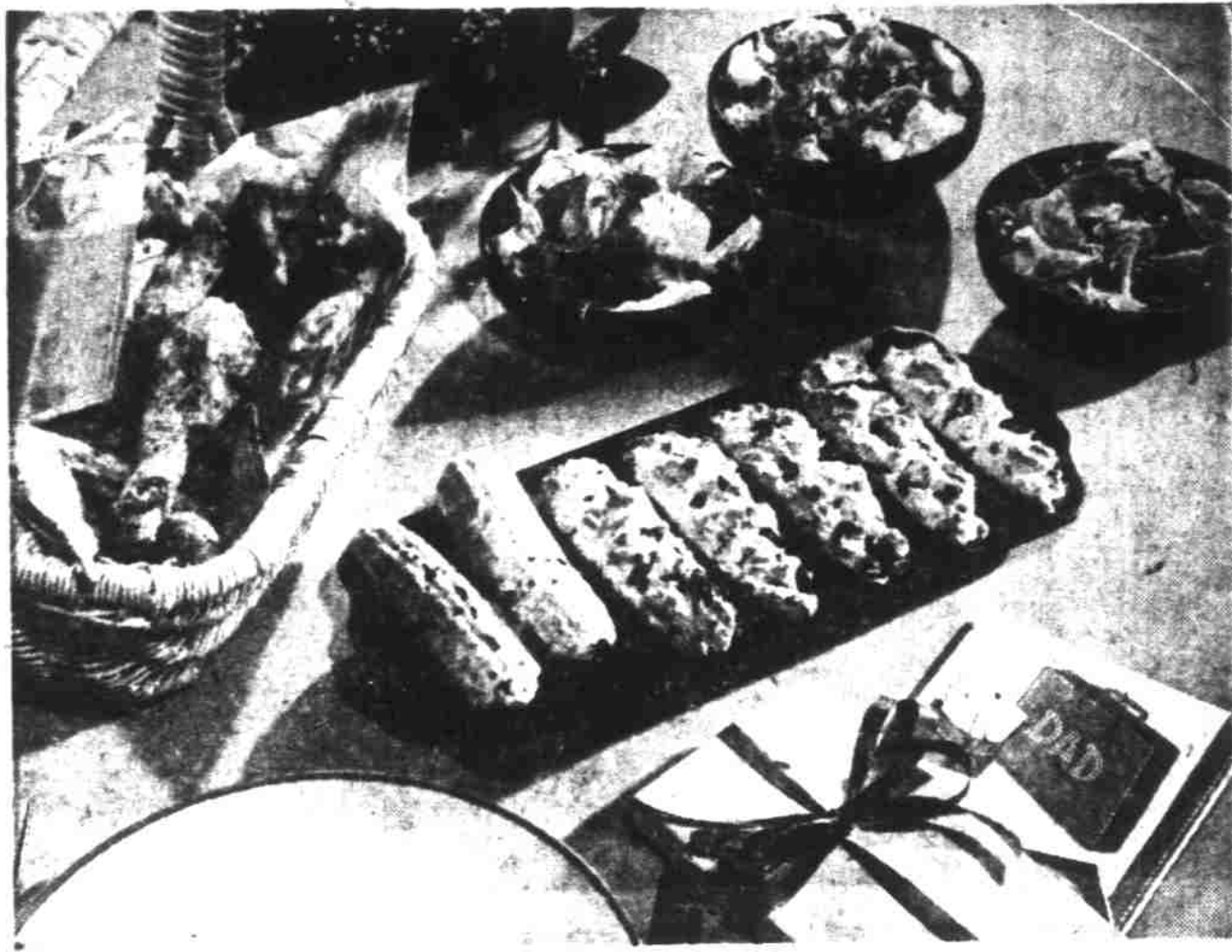
You can have a lot of fun with these corn muffin tins that are hidden away in the back of the kitchen cupboard. They add interest to regular corn muffins, and give additional glamor to fancy ones. Here the corn sticks have olives to make them look and taste good, and a few extra seasonings to heighten flavor even more.