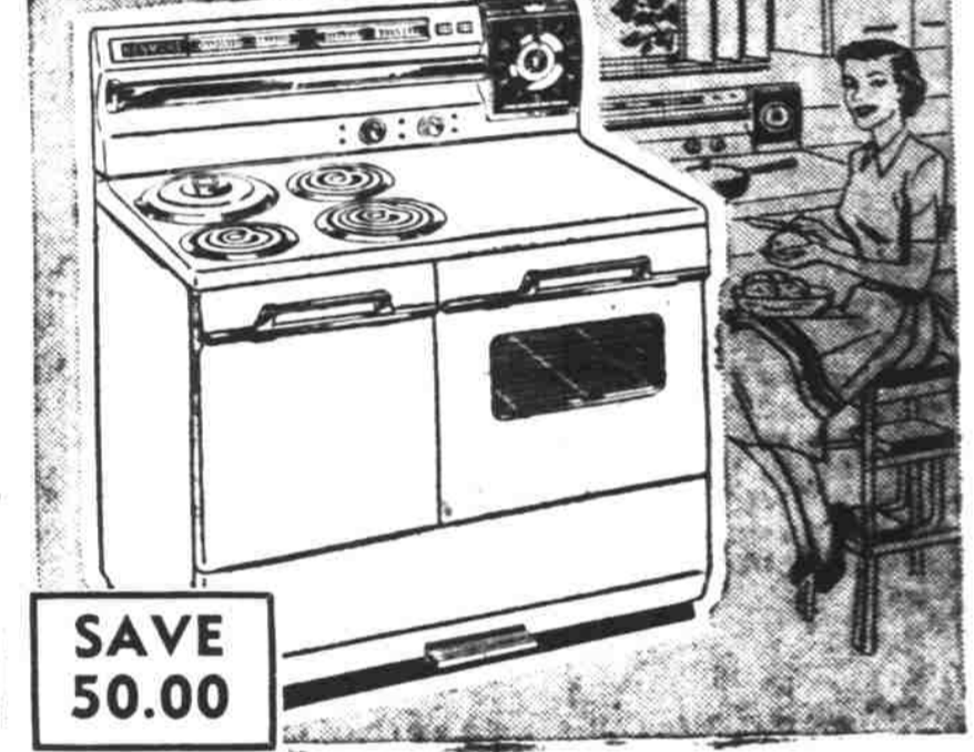
Regulate Heat with The Push of A Button! Kenmore