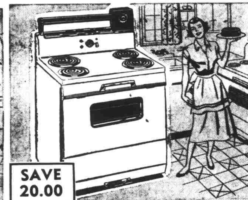
Most Economical Full Width, Full Feature Range!