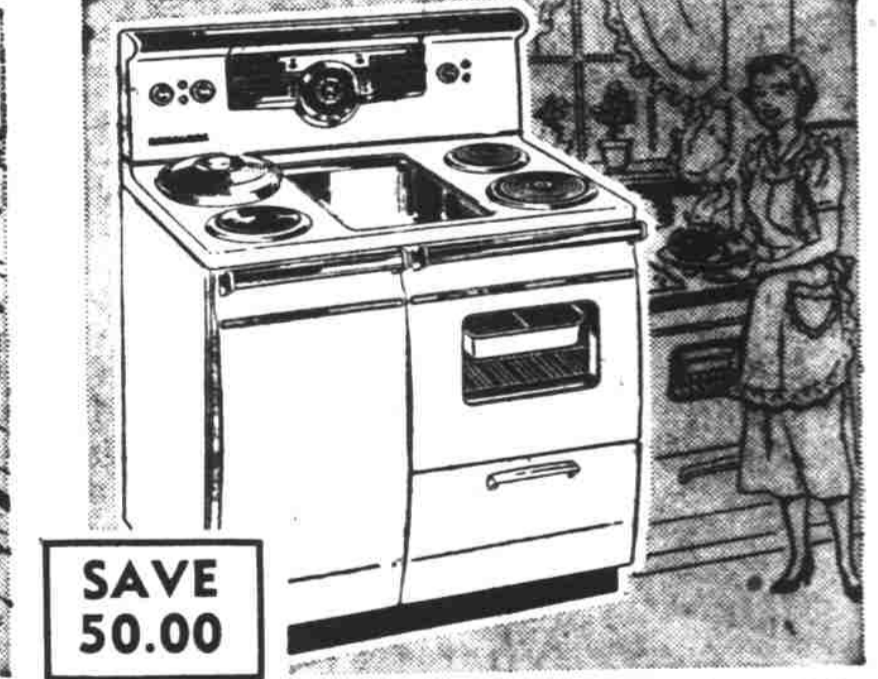
Compact Kenmore Electric Range For Cooking Convenience!