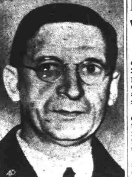
Eamon De Valera, who Thursday lost to John A. Costello for the post of prime minister of Ireland.