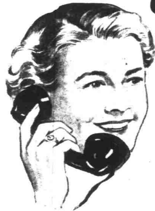
"THE CHILDREN ARE GIVING ME A SUNBEAM"