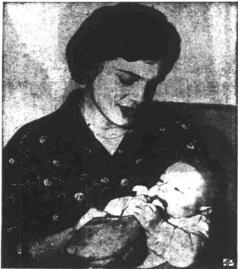
STAR ROLE AHEAD —Rossana Podesta, 19-year-old film actress who'll star in new super-epic movie "Helen of Troy," cares for her two-month-old baby in Rome, Italy, home.