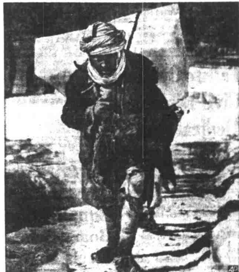
ICEMAN IN AFGHANISTAN —An Afghan coolie carries a block of ice cut from a frozen paddy field near Kabul to a storehouse for use in summer when weather gets hot.