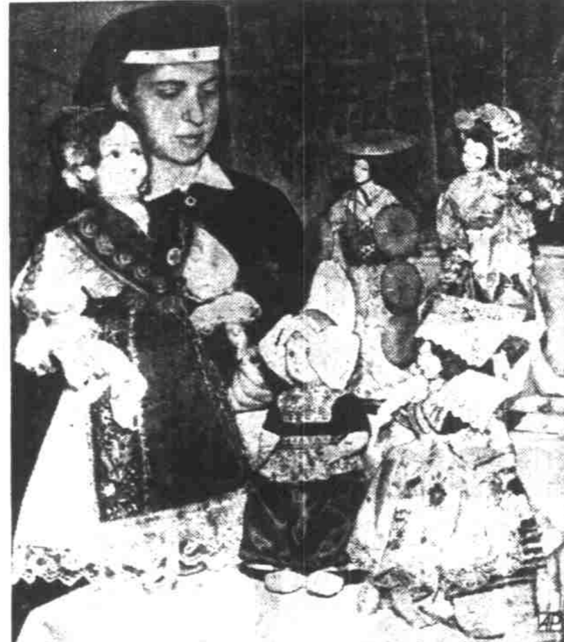
FROM MANY LANDS —An Italian Red Cross nurse looks at exhibits in international doll show at Palazzo Venezia, Rome, once Mussolini's headquarters. Dolls were sold for charity.