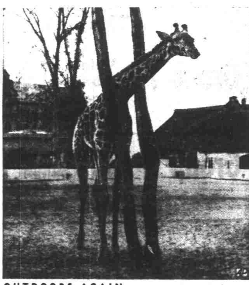
OUTDOORS AGAIN —This giraffe enjoys balmy weather after being let out of winter quarters in Frankfurt, Germany, Zoo. Protective screen around trees is to prevent nibbling.