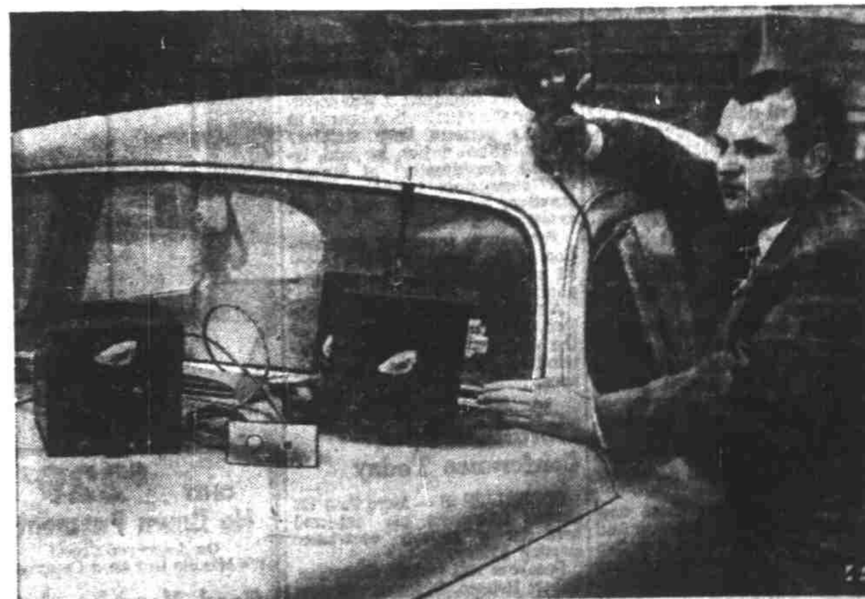
TRAFFIC STOPPER —"Electronic brain" held by Miles V. Barasch, of Downey, Cal., snaps green traffic lights to red to clear intersections ahead of speeding emergency vehicles.