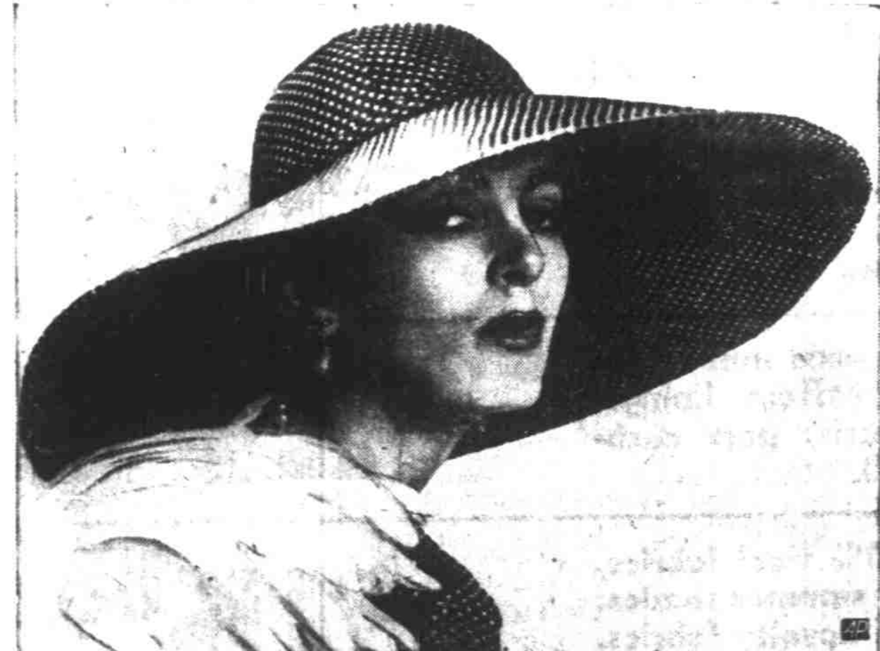
ENOUGH MATERIAL FOR SEVERAL HATS —The complete lack of trimming accents the sweeping lines of this large brimmed hat of polka-dotted blue silk.