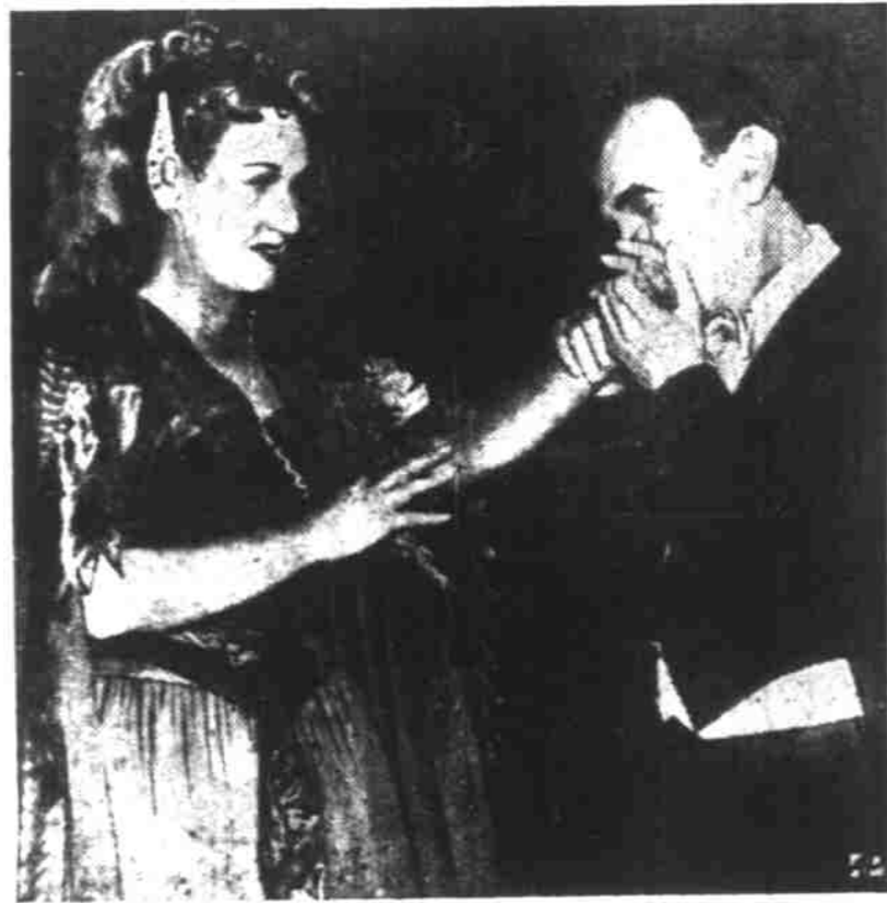
BUSY OPERA STAR —Rise Stevens is greeted by composer Virgilio Mortari after singing in world premiere of his opera "The Devil's Daughter," at La Scala, Milan, Italy. Two days later she sang Carmen in New York's Metropolitan Opera House.