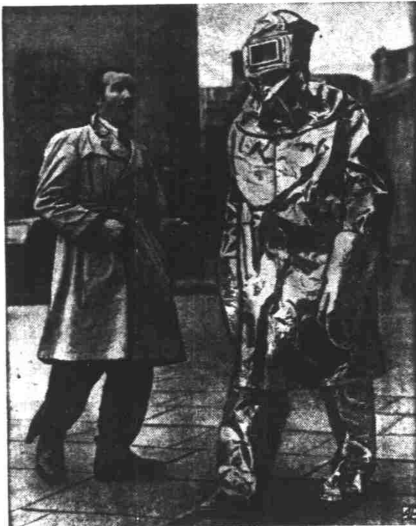
SURPRISE —A passerby gazes at suit of aluminum—which it's claimed can withstand 2,300-degree centigrade heat—worn by man enroute to display it at London equipment exhibit.