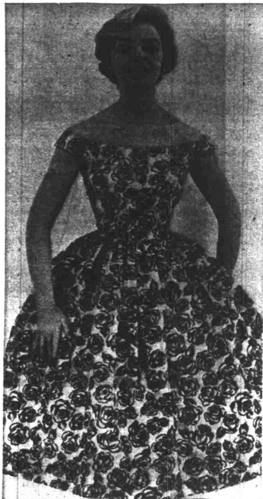
Yellow roses etched in black form the background for this spring and summer cotton dress. The yellow roses are traced with the black outlines modern painters taught us to like. Cotton broadcloth is the material with black velvet tufting to point up influence of modern art on teenage clothes.

Miss Saunders contends that the Parisian designers have designed an uncluttered, unadorned look for Spring. There has been little or no dependence on trimmings. The fashion story can be told in design, cut and fabric.