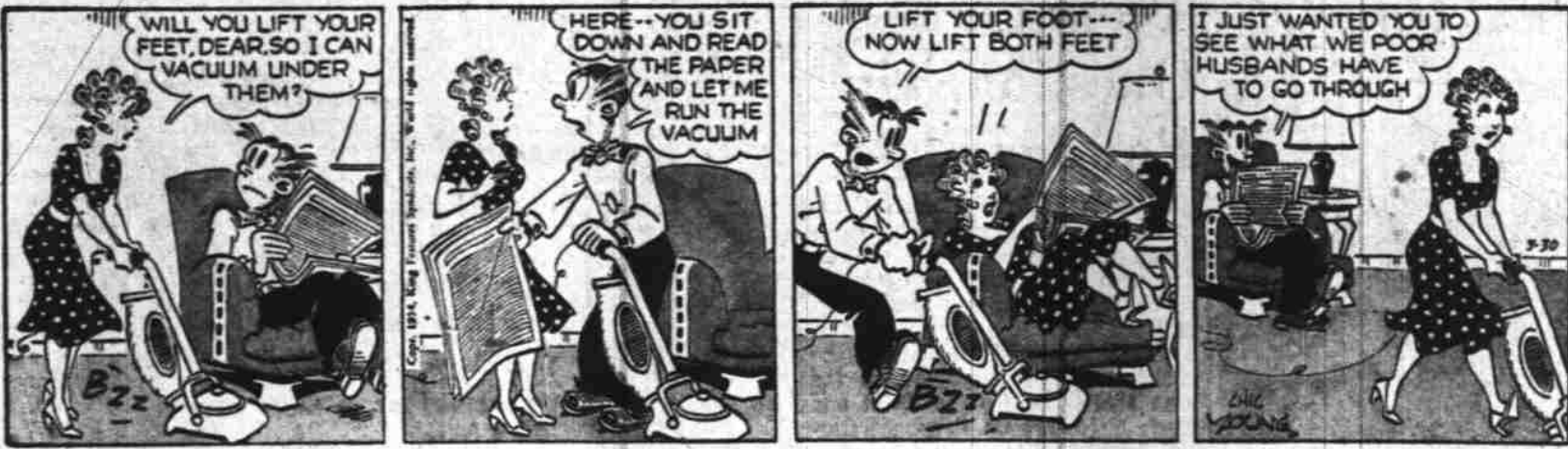
BLONDIE By CHIC YOUNG