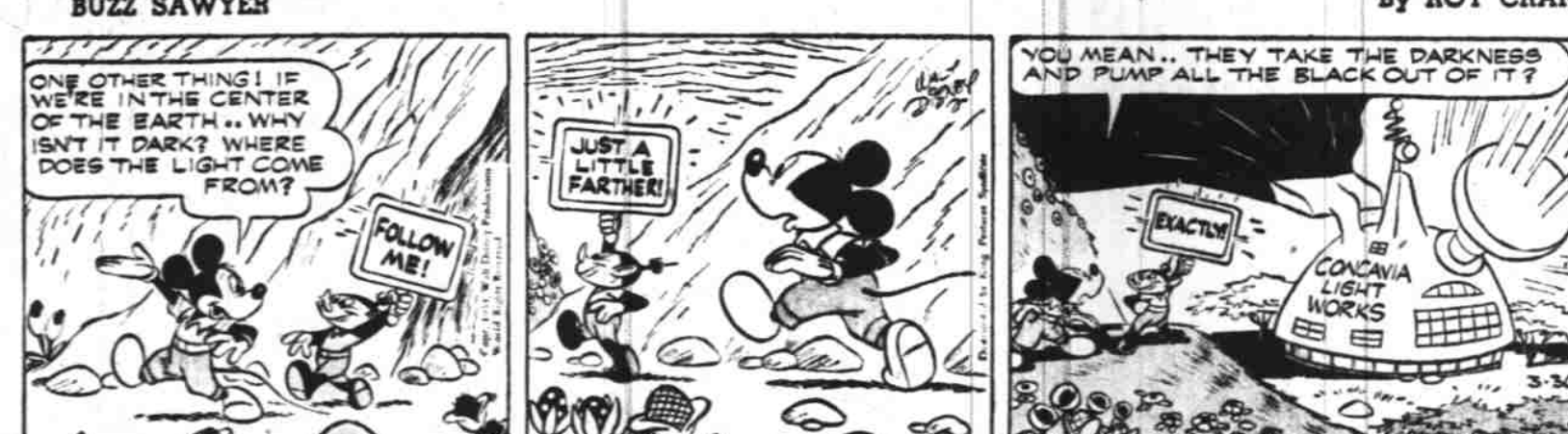
MICKEY MOUSE By WALT DISNEY