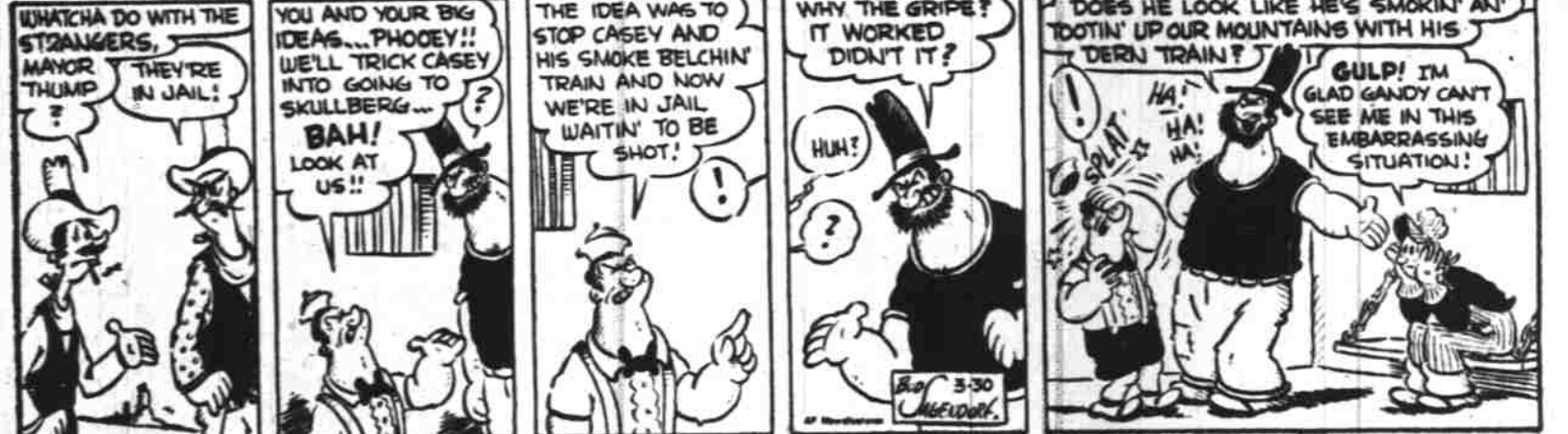
SPUR LINE By BUD SAGENDORF