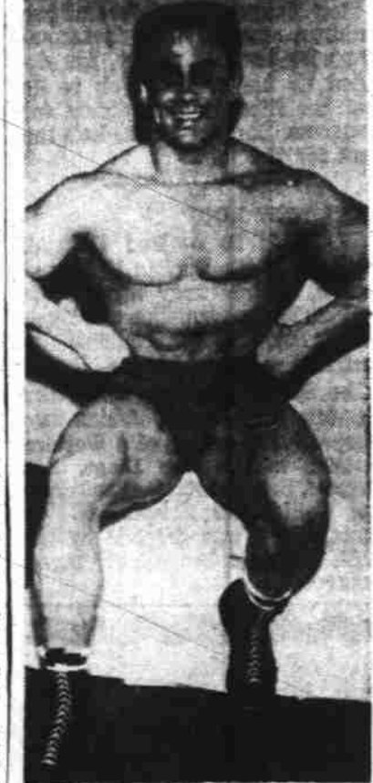
PEPPER GOMEZ Big Chance Tonight