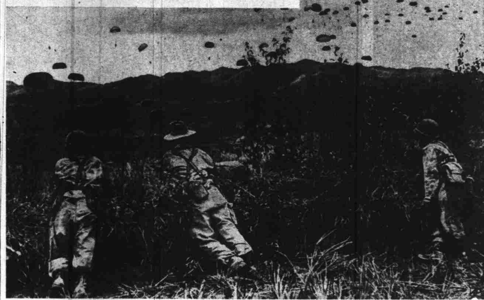
UMBRELLAS—Previously landed troops protect landing of French and Vietnamese paratroops brought up to Dien Bien Phu by planes flying a shuttle service from Hanoi. Arrows on map (below) show encircling attack of the Communist-led Vietminh whose current campaign in Indochina is regarded as setting the stage for bargaining at the Geneva conference.