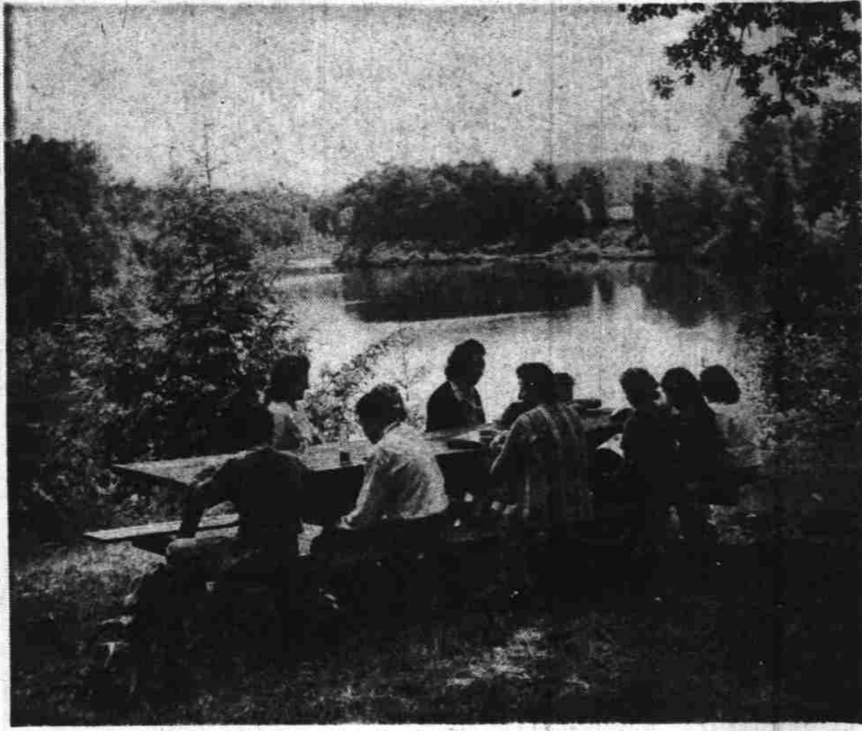
The Willamette Valley picnic-camping season is just around the next rainstorm. And for a growing number of local outdoor enthusiasts city, state and federal park authorities are increasing camping and outing facilities in this area so that such sites are now numerous and easily available. Shown above is a typical summer-time picnic scene taken at Champeong State Park on the Willamette River.