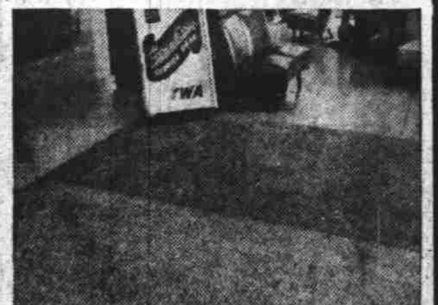
LOS ANGELES: "Half and half" test proves point on West Coast. Note clean lower half of carpet which was Resistsoil-treated. Dirty upper half was untreated. Both halves of carpet suffered same amount of dirty-shoe traffic.

FREE ESTIMATES Dial 4-6313 For an Appointment In Your Home No Obligation