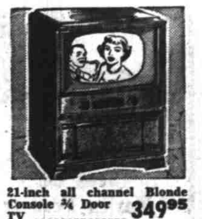
21-inch all channel Blonde Console 3/4 Door TV 349 95