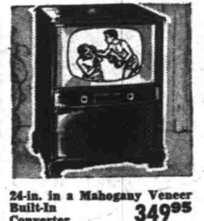
24-in. in a Mahogany Veneer Built-In Converter 349 95