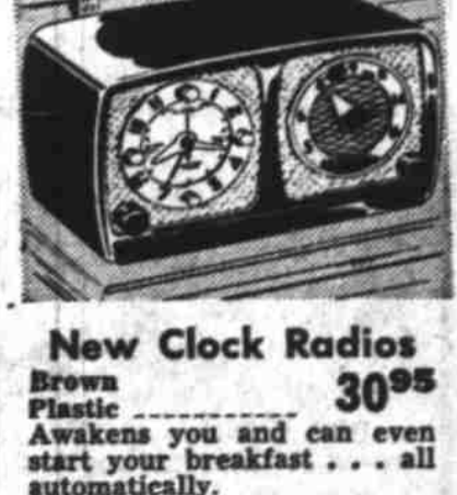
New Clock Radios Brown Plastic 30 95 Awakens you and can even start your breakfast . . . all automatically.

Nationwide Guaranteed Service The only national retail firm with its own trained TV service technicians whose work is unconditionally guaranteed by Sears.