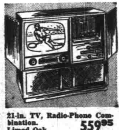
21-in. TV, Radio-Phone Combination. Lined Oak 559 95