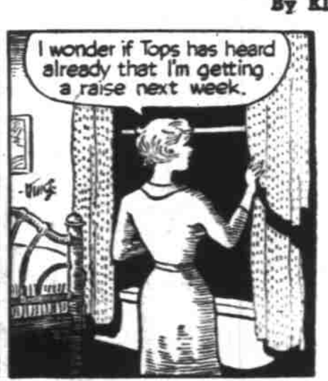
By FRED LASSWELL