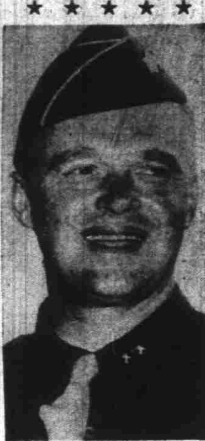
GENERAL WILLIAM DEAN Released by Reds